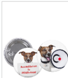
Buttons, 3-pack (E)