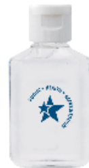
Hand Sanitizer (E)