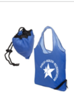
Tote Bag (E)